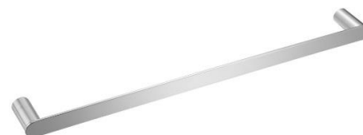
AI1313CS Satin finish